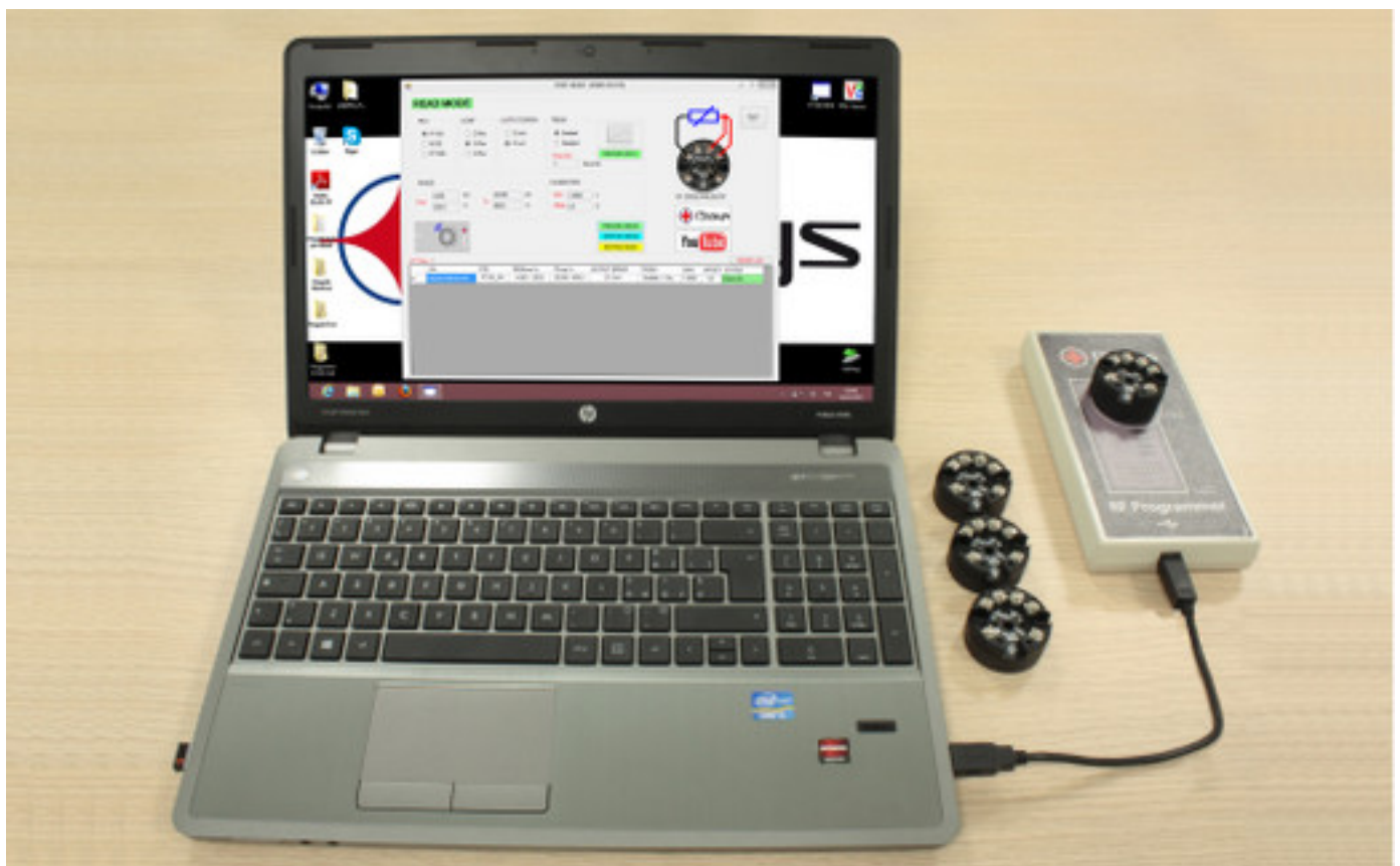
Programming tool RFid (NFC) with RF programmer

A free App for Android devices is available for download at Google Play Store, allowing to program the converter , to read logged data and to visualize them as graph.